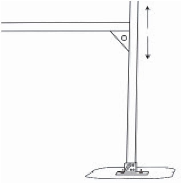
U-Anchor Securement Detail