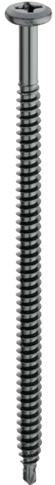
Enlarged to show detail.