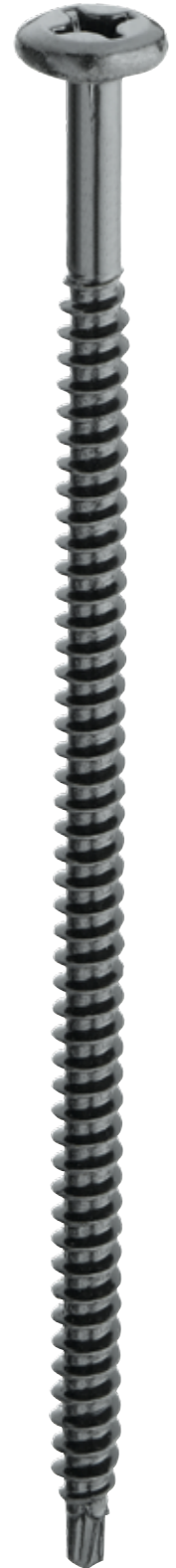
Enlarged to show detail.